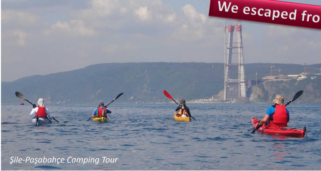
Şile-Paşabahçe Camping Tour

We escaped from city to nature with 4 camping tours!