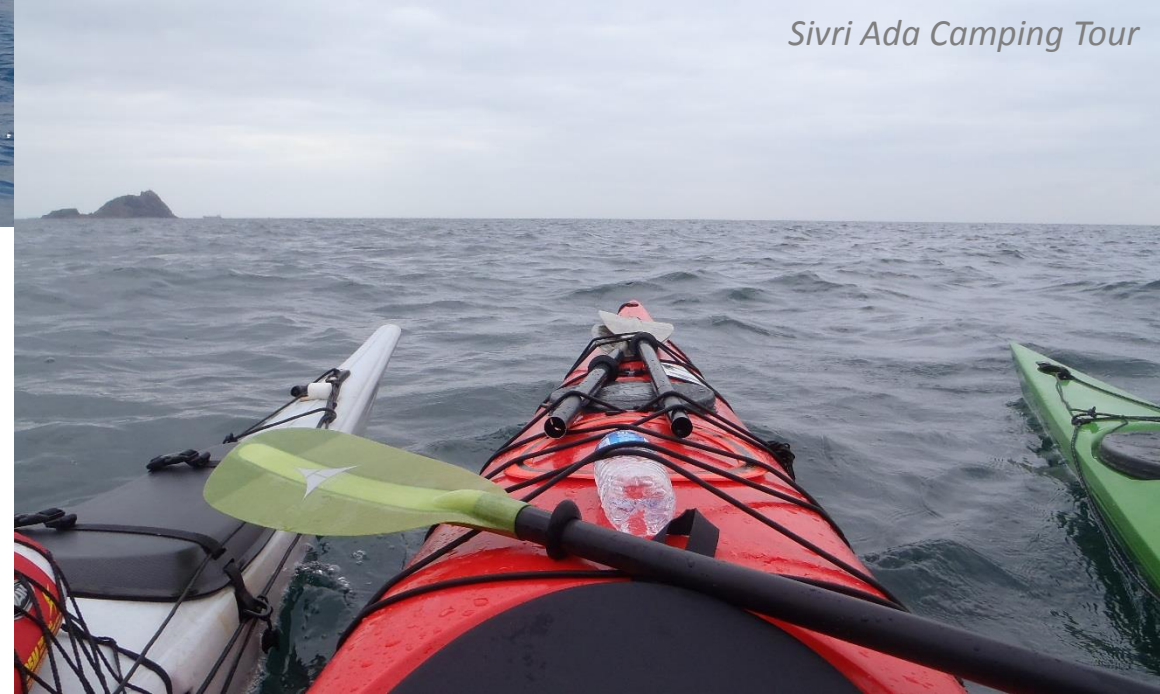
Sivri Ada Camping Tour